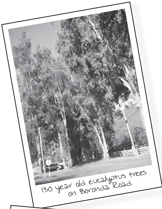
130 year old eucalyptus trees on Boronda Road.

http://savetheborondatrees.blogspot.com & http://carmelvalleyhistory.blogspot.com